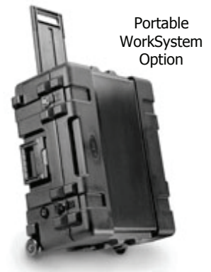
Portable WorkSystem Option

Our Registered Dietitian designed meal templates provide the professional weight management consultant with the credibility to consult with confidence. These ready-to-print meal plans and grocery lists save time and can be used over and over again. R.D. designed meal templates reduce the liability considerations and increase credibility. Our collections include meal plans designed for specific dietary, health and lifestyle needs ranging from disease prevention, stable blood sugar, low calorie and other popular eating plans.